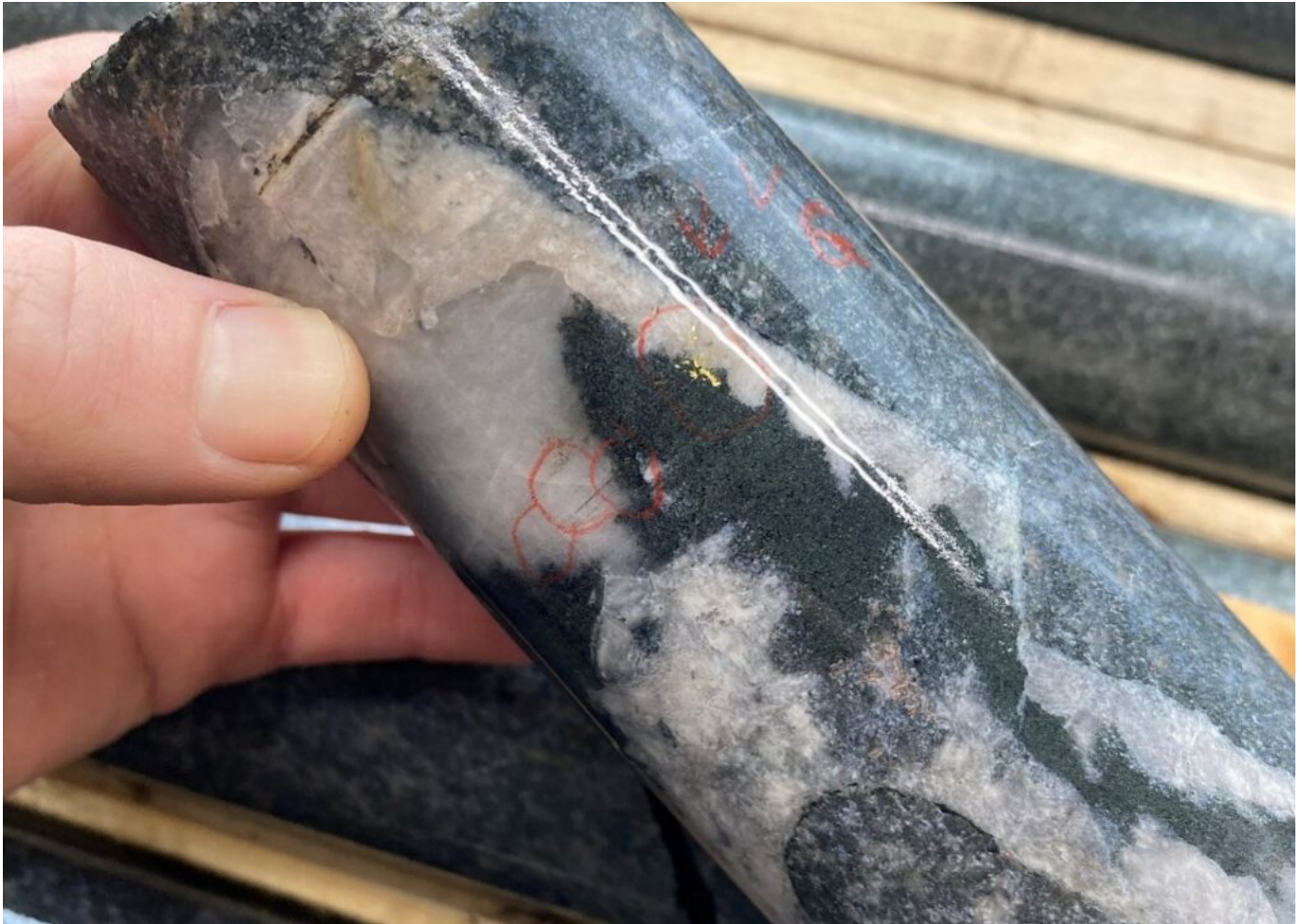
Picture 1. Visible gold in hole AG-21-097

In some of the quartz veins, visible gold is associated with iron-rich chlorite alteration emplaced and crosscutting the quartz veins. This association between gold and iron-rich chlorite observed at the Glade West Showing is similar to the association between iron-chlorite and gold at the Scadding Deposit. The potential relationship between the mineralization observed at Glade and the Scadding Deposit, located 800 m north, could represent a considerable extension to that mineralized system.